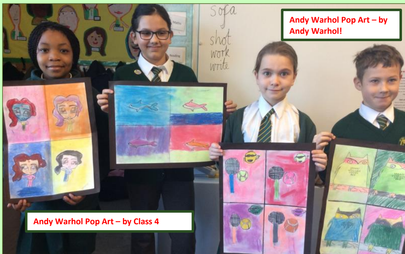
Andy Warhol Pop Art – by Andy Warhol!