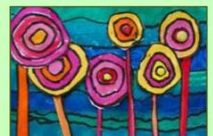
Lollipop Trees – by Hunderwasser