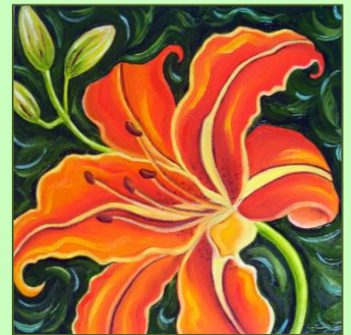
Jungle Flower – by Georgia O'Keeffe