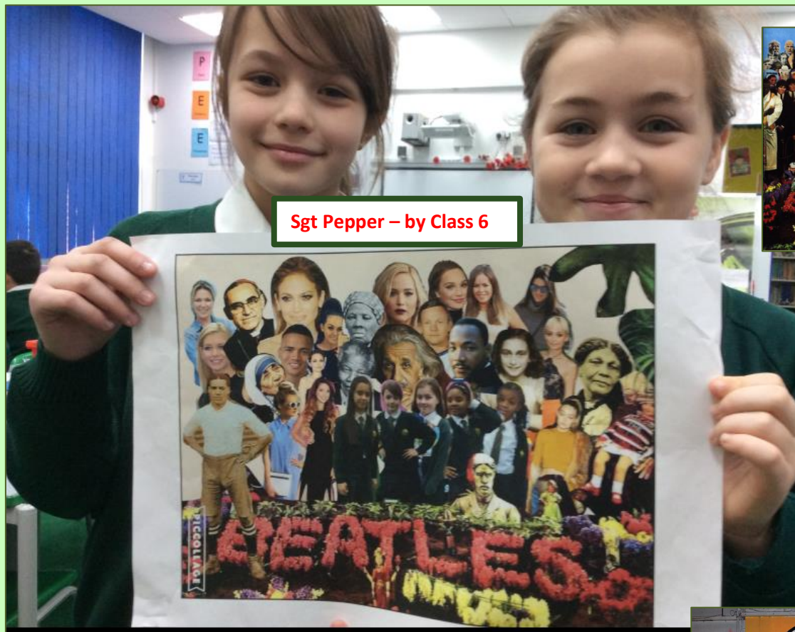
Sgt Pepper – by Class 6