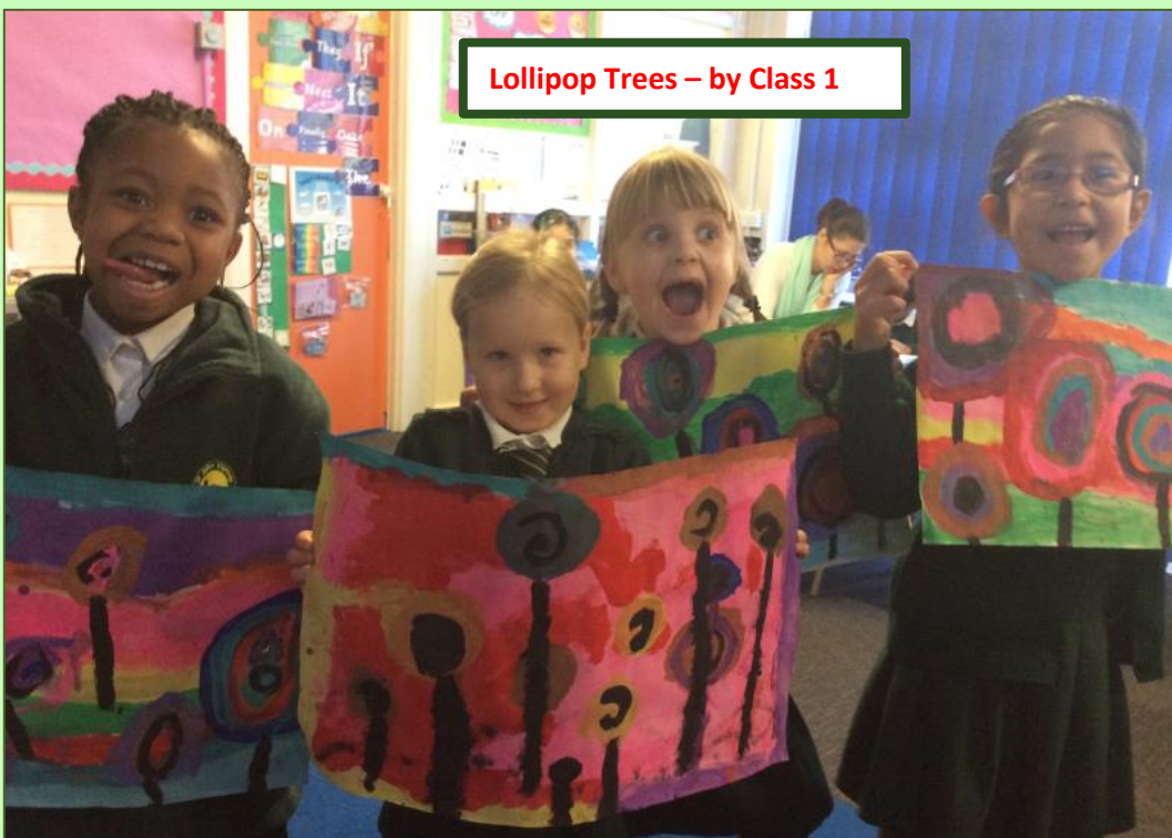
Lollipop Trees – by Class 1