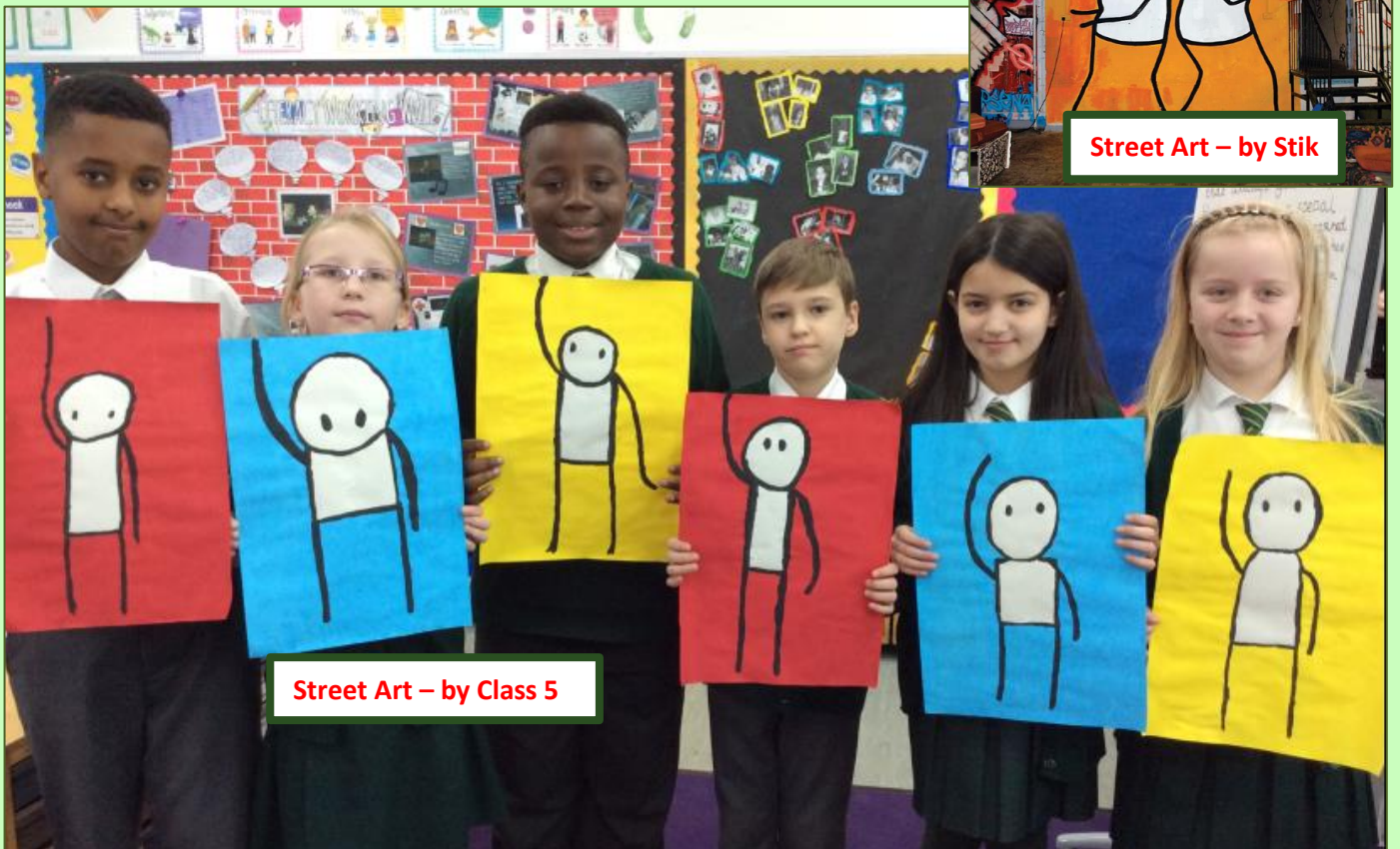
Street Art – by Class 5