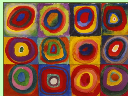
Colour Study – by Kandinsky