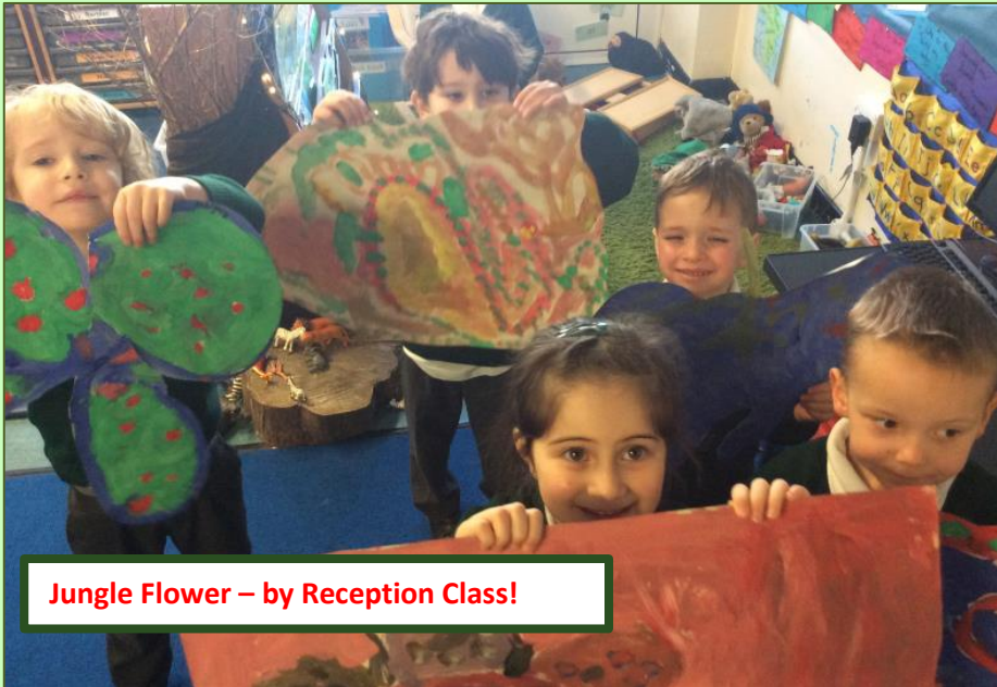
Jungle Flower – by Reception Class!

In our recent Creative Art Day, each class chose a famous masterpiece and used to create our own works, inspired by the Masters' techniques and genius!