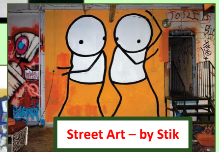
Street Art – by Stik