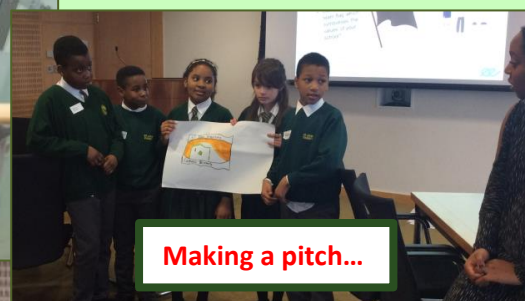
Making a pitch...