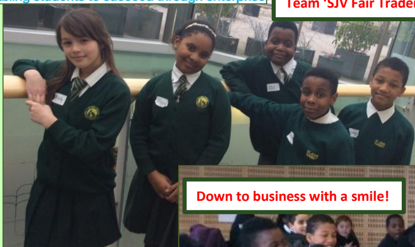
Down to business with a smile!