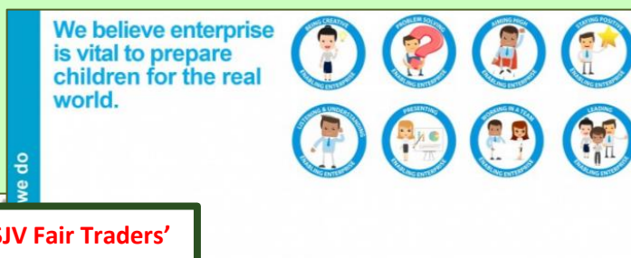
Team ‘SJV Fair Traders’