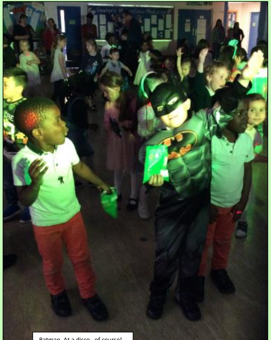
Batman. At a disco...of course!