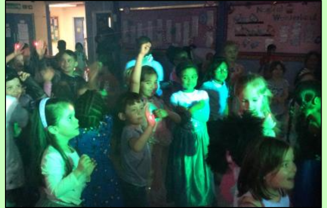
Captain Fantastic – fantastic by name...