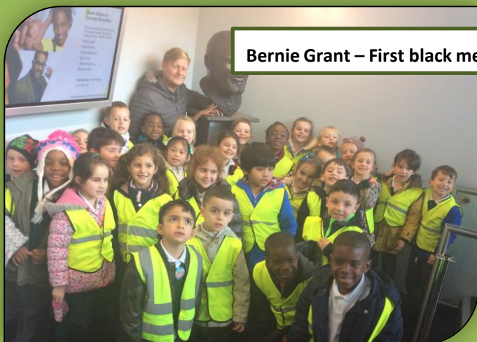
Bernie Grant – First black member of parliament

Congratulations to our pupils for such a wonderful celebration.