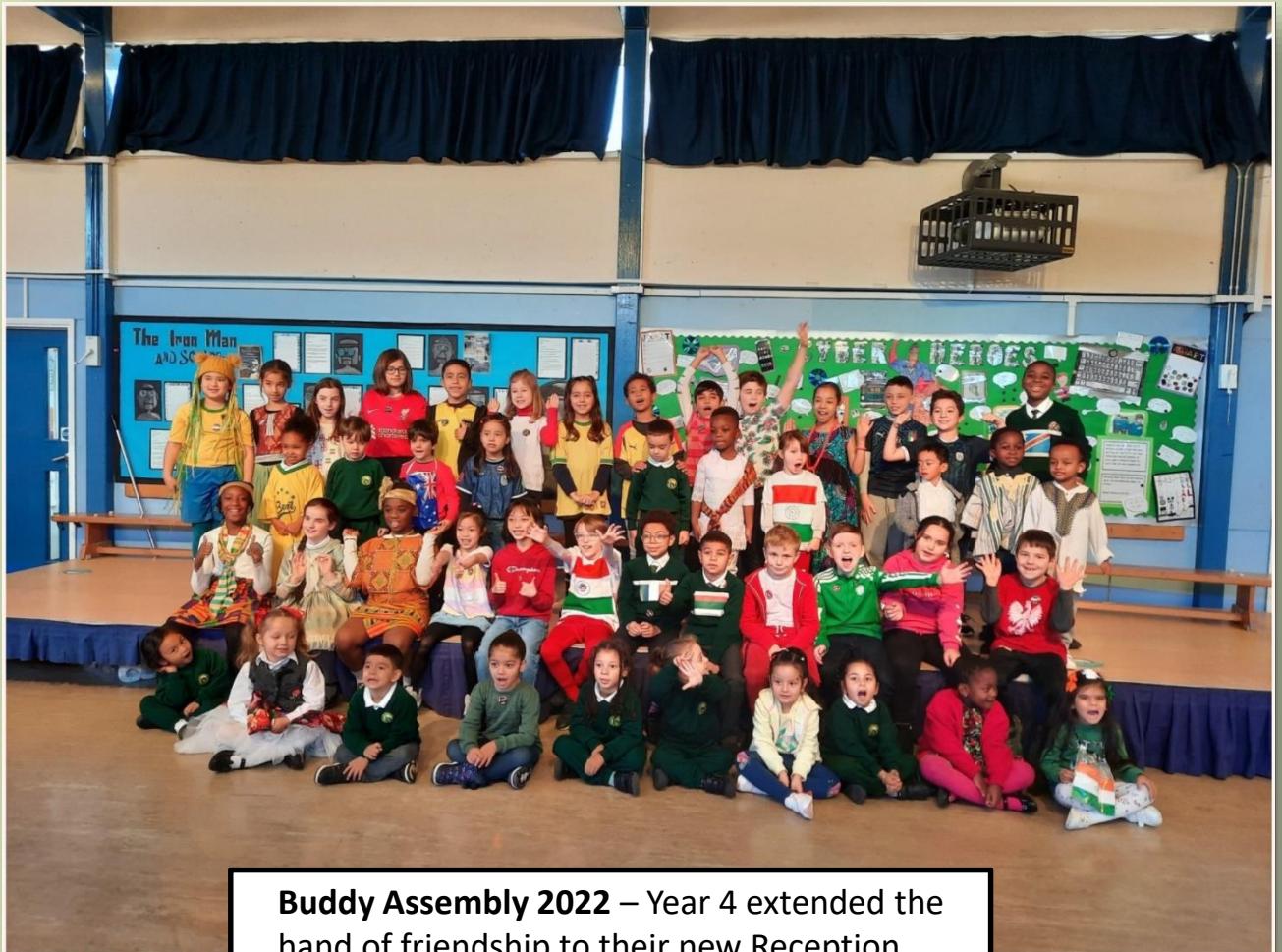
Buddy Assembly 2022 – Year 4 extended the hand of friendship to their new Reception Class Buddies! Friends for life!